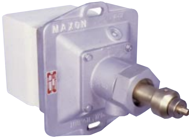
OXY-THERM ® Oil Burner