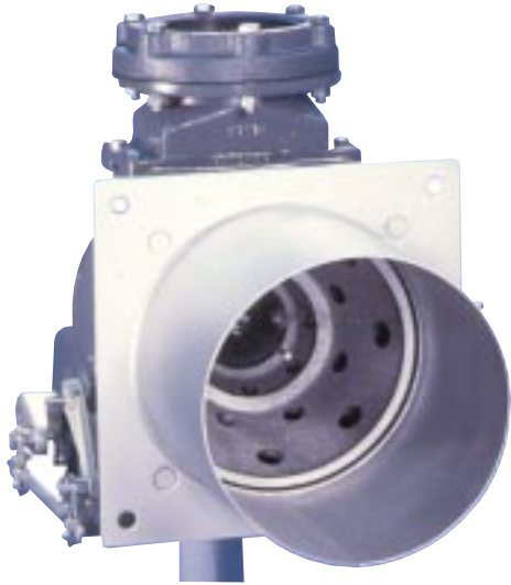
Model EB-3 OVENPAK® Burner with connecting base and linkage assembly