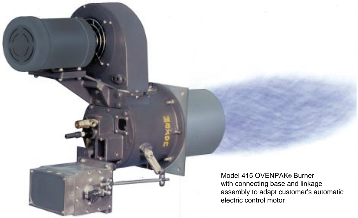
Model 415 OVENPAK® Burner with connecting base and linkage assembly to adapt customer's automatic electric control motor