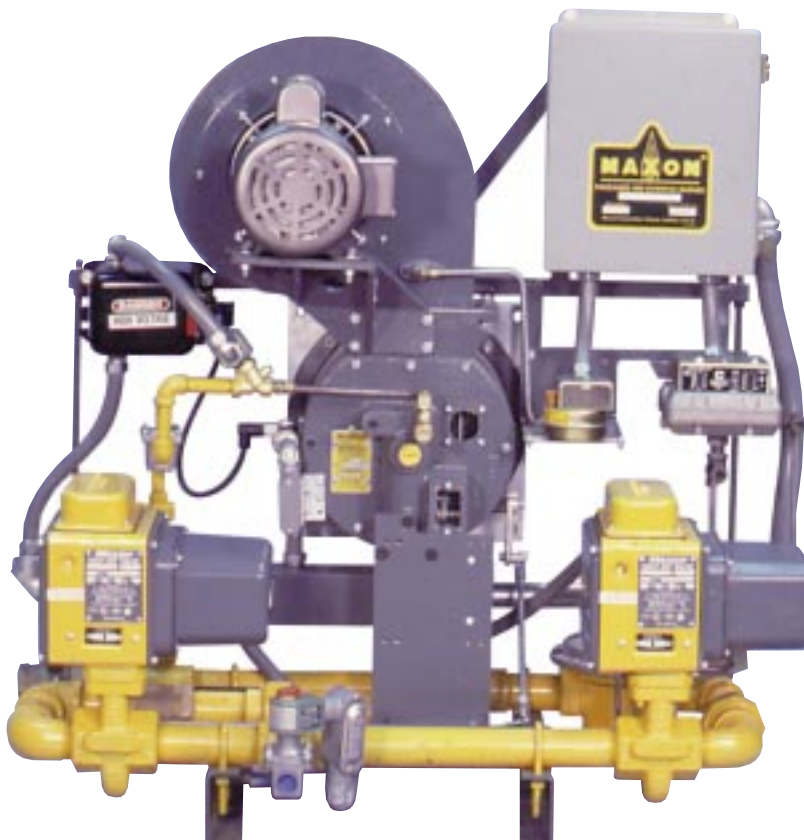
Model 435 OVENPAK® Burner with pre- assembled “Block & Bleed” pipe train and pre- wired into package system