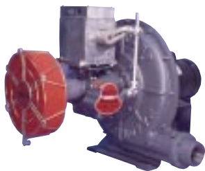
PREMIX® Blower Mixers (see catalog bulletin 3100)