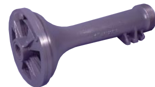
VENTITE™ Inspirator Mixers (see catalog bulletin 3300)